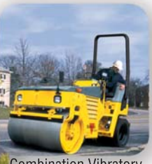
Combination Vibratory-Pneumatic Rollers