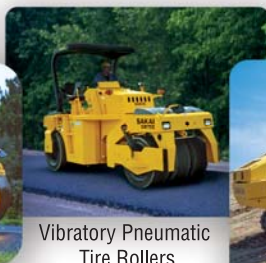
Vibratory Pneumatic Tire Rollers