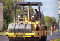
Vibratory Asphalt Rollers