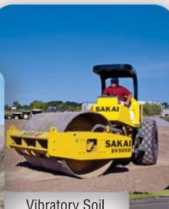
Vibratory Soil Compactors