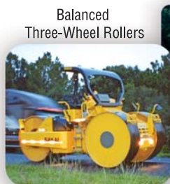
Balanced Three-Wheel Rollers

For more information or a demonstration of SAKAI products, please contact Tracey Road Equipment today at 800-872-2390.