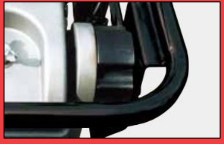
Reduced shock vs. competitors