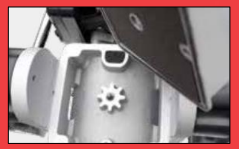
Multi air cleaner for extd. maint.