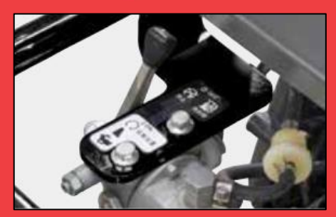
Throttle lever acts as fuel-cutoff