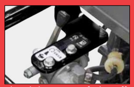
Throttle lever acts as fuel-cutoff